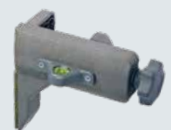
C50 Adapter included with CR600 receiver