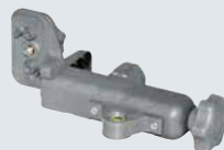
HL700, HL750/U and HL760/U includes C70 Adapter for receiver with Bubble Vial PN C70